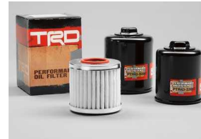
TRD Oil Filter $13 Parts Only MSRP**