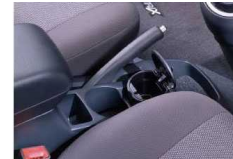
Ashtray Cup $26 Installed MSRP*