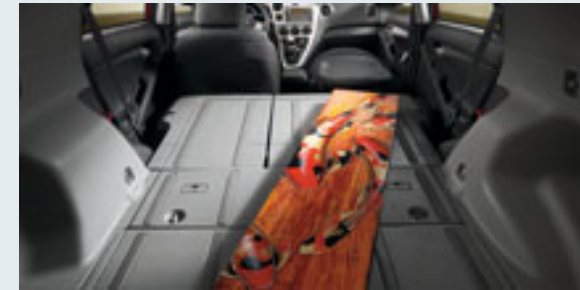
S interior shown in Dark Charcoal with front passenger and rear seats folded flat S and XRS only.