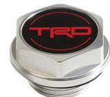
TRD Oil Cap $57 Parts Only MSRP**