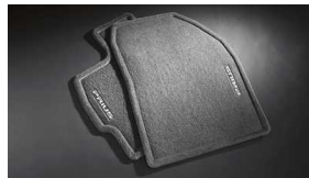
Carpet Floor Mats & Cargo Mat $200 Installed MSRP*