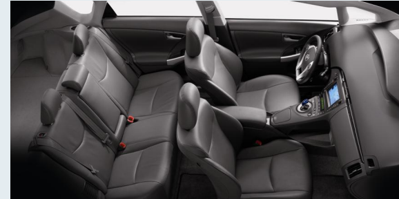
Prius interior shown in Dark Gray leather with available Advance Technology Package [28]