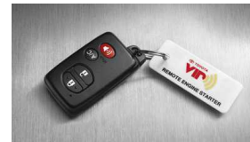
Remote engine start $529 Installed MSRP*