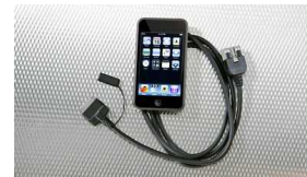
iPod Interface $299 Installed MSRP*