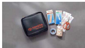
First aid kit $29 Installed MSRP*