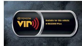
VIP RS3200Plus Security System $359 Installed MSRP*